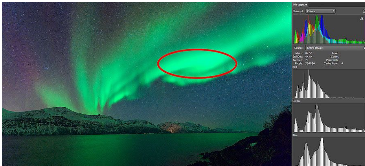
Image Example 1 - Overexposure

Camera Settings: 10 Seconds, f/2.8 ISO2500