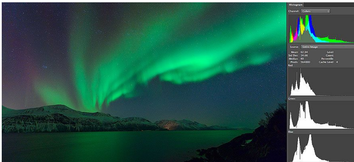
Image Example 2 - Correct Exposure

Camera Settings: 10 Seconds, f/2.8, ISO2000