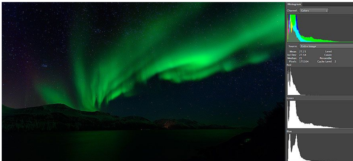
Image Example 3 - Optimal Exposure

Camera Settings: 10 Seconds, f/2.8, ISO1000